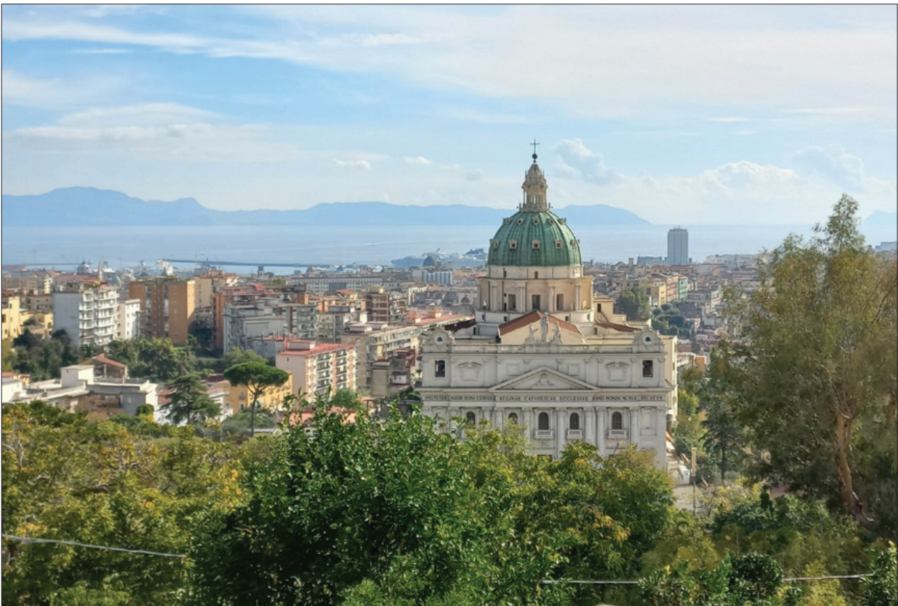
View across Naples from the meeting venue, Villa Colonna Bandini in the Colli Aminei: a sweeping panorama of historic rooftops, the Bay of Naples, and the commanding silhouette of Mount Vesuvius beyond