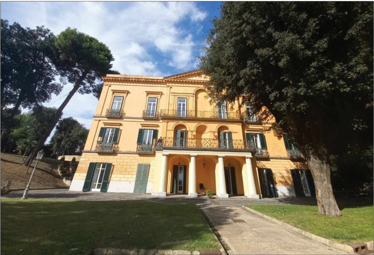
The historic Villa Colonna Bandini , an imposing 19th century villa, provided a fitting and evocative venue for the ICOH Midterm Meeting