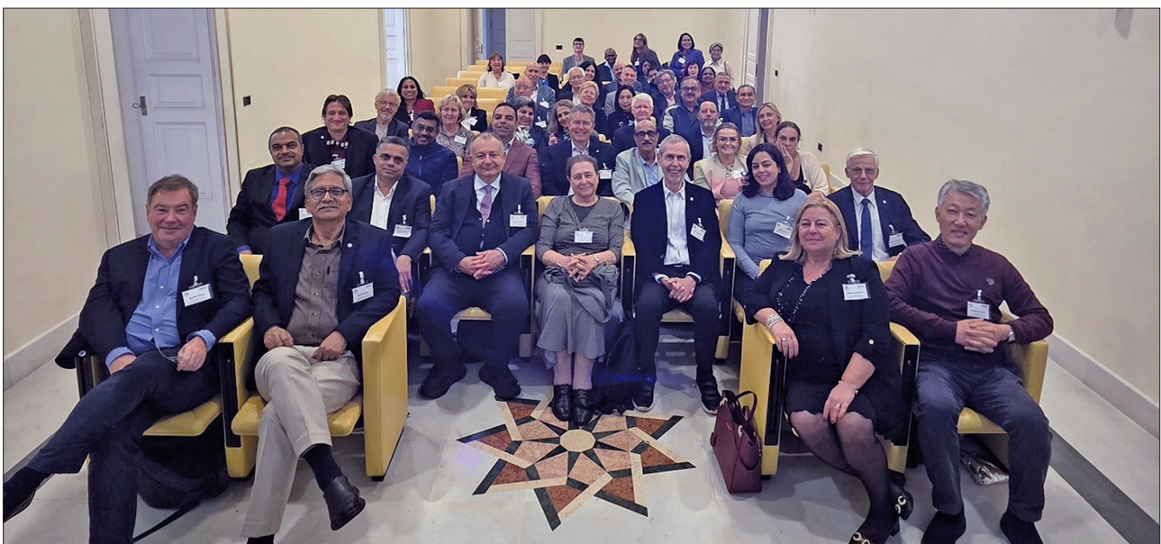
'Come one, come all' – The ICOH Midterm Meeting brought together representatives of the organisation's leadership to review progress and strategic priorities in line with the current triennial work plan

The Midterm Meeting was made possible through the valued support of the Italian Workers' Compensation Authority (INAIL) and was hosted at the historic Villa Colonna Bandini , a distinguished 19th century villa located on the Colli Aminei, a hilly and verdant residential district overlooking Naples. Originally built in the early 1800s, during the Bourbon period, as a hunting residence associated with the nearby Royal Palace of Capodimonte, the villa later became the private property of Princess Bianca Doria Colonna of Avella, and was redesigned in an elegant neo-classical style by the Florentine architect, Antonio Niccolini. Surrounded by terraced gardens with diverse botanical species, the villa remains a refined example of Naples' aristocratic architectural heritage, and presents an evocative setting for cultural and institutional events.